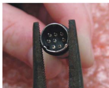
Slight squeeze with pliers