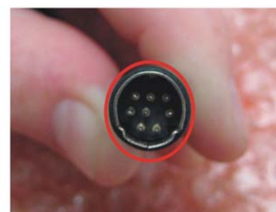
Modified Plug Slightly Oval